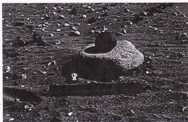
Figure 2 Deflated midden material and grindstone (scale=30cm).

The other key issue in the dating of non-stratified sites relates to ensuring that the material chosen is of cultural origins. Selection of shell for dating, therefore, was wherever possible carried out on mangrove species which have been culturally transported some 2km northward from the extensive mangrove forests to the beach. Other factors supporting cultural origins of dated samples include the marked differences between humanly selected shell species and individuals and those deposited through natural processes. Naturally deposited shell from such action as storm/cyclonic events tends to be extremely heterogeneous in terms of species present, including species known to be 'non-economic', covers the whole range of sizes within a population