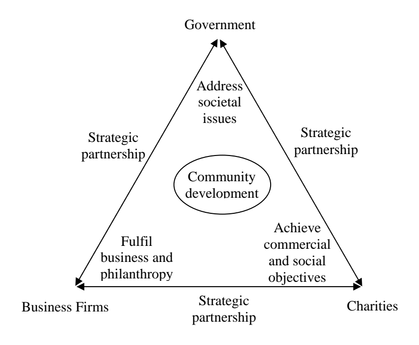
FIGURE 1. Business-Charity-Government Strategic Partnership

Figure 1 below demonstrates the business-charity and government strategic relationship. Government agencies often have some role in addressing societal issues and, in many cases, are the funding providers for social service and community based charities (Huxham and Vangen, 1996).