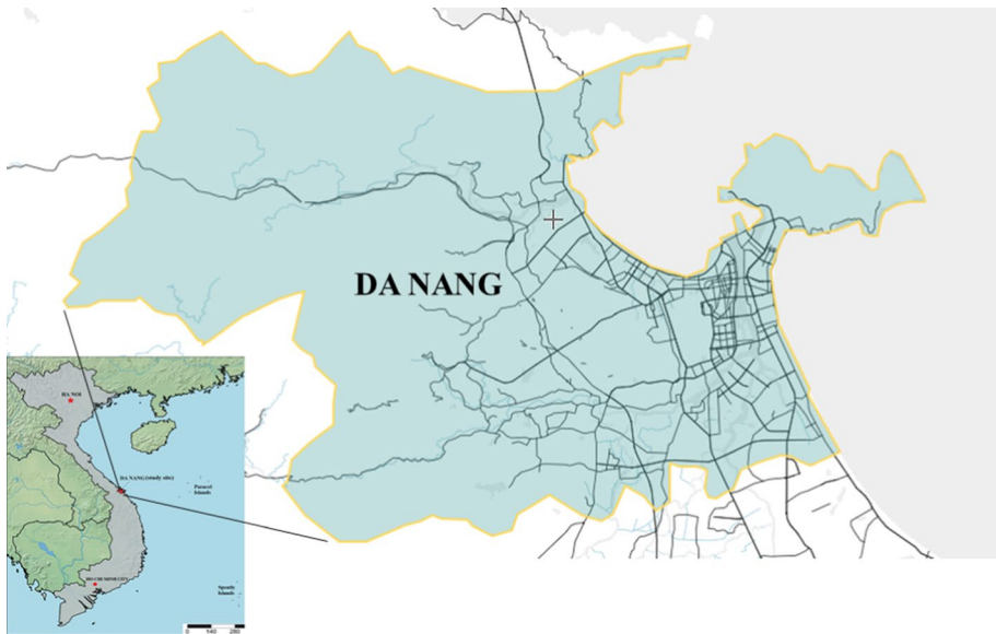
Fig. 1 Location of study site – Da Nang, Vietnam