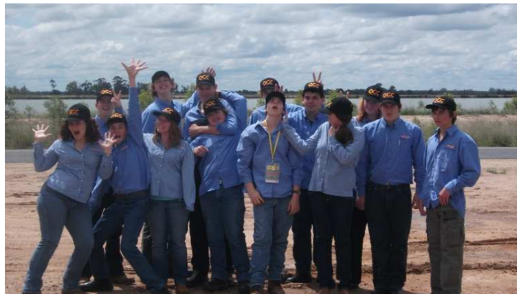
Figure 2: Students on Site Visit

It wasn't all hard work for the students; they managed to have a good time as well. The site visits were welcome relief from researching their topic as can be seen from Figure 2.