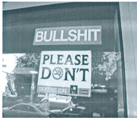
Figure 2: Another, arguably more influential, work of social commentary.