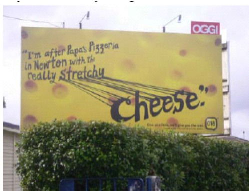
Figure 3: Stretching the Integrity of Educational Initiatives

In an attempt to make ends meet, school principals and parent bodies are increasingly being cajoled into operating the school as a commercial enterprise. This is the school as a sales agent.