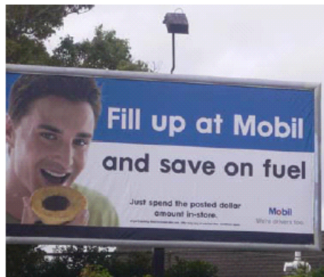
Figure 2: Competing Pedagogies: The Public Trumps the Formal

less-than-delicately squeezes the school of community-derived funds, the school becomes amenable to persuasion that opening itself up to commercial exploitation is the smart thing to do (see Figure 1 for an example of explicit touting for business from a local public school). Whilst not the focus of this paper, a simple example of the pimping of the school - in a very real physical sense - is necessary to root our analysis here.