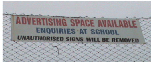
Figure 1: Pimping the School

...children in the U.S. confront the concocted image of the American empire as one that equates freedom and democracy with the holy gospel of free trade - a monolithic and undifferentiated image if there ever was one. (p 70).