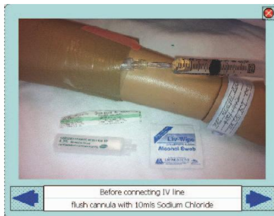
Figure 3: Support material access

package chosen for this system allows easy integration with the programmable controller at a number of levels. This allows seamless integration of the sequencing, audio and video aspects of the training system. It also means that usage data can be extracted from the HMI system, logically evaluated against a performance rubric and the results displayed at the end of an assessment session. Fig. 4. shows a summary screen indicating strengths and weaknesses so students can self assess their progress.