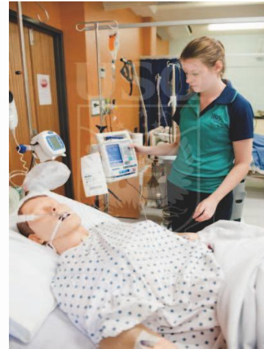
Figure 1. 1 st year nursing student tending to an IV infusion

The concept of remote simulation as a teaching strategy in nursing education, while not an entirely new concept, has experienced renewed interest in relation to its ability to deliver