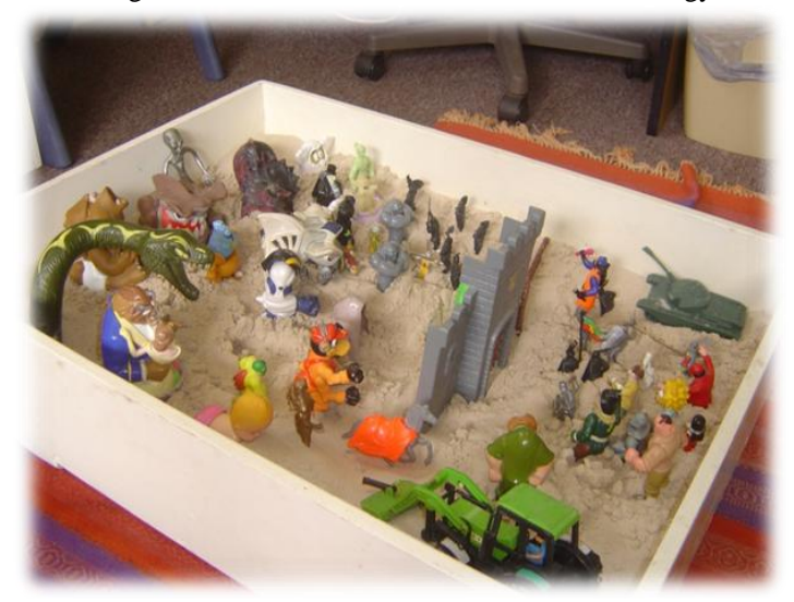
Figure 2. Battles

In Session 4 the client experimented with a number of symbols, did not ask for water and selected common symbols from a range of symbols that depicted television characters such as Gumby and some superheros. By the fifth session some order was evident in the play and the young boy began regular play each week that involved battles sometimes between animals, sometimes animals against forest clearers, and sometimes between characters trying to storm a castle. The play usually started as disorganised affairs and usually resulted in a chaotic victory by one side but gradually by week seven evolved into more of a strategic set of manoeuvres that showed a clear strategy and a clear victor.