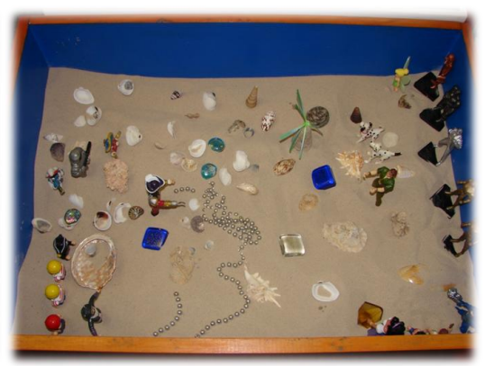
Figures 3 & 4. The rise of the hero figure

In these photographs one can see Spiderman but in the second box notice the beginnings of play with Peter Pan, with whom the young boy seemed to identify heavily. The client used Peter Pan each week for the next few weeks. Note how organised the play is now as his world seems to reflect an abundance of beauty and riches rather than chaos and disorganisation. His class teacher said that his behaviour was now much better and he seemed a little too friendly with another boy in the class. She said that both classroom outbursts and playground incidents had decreased dramatically.