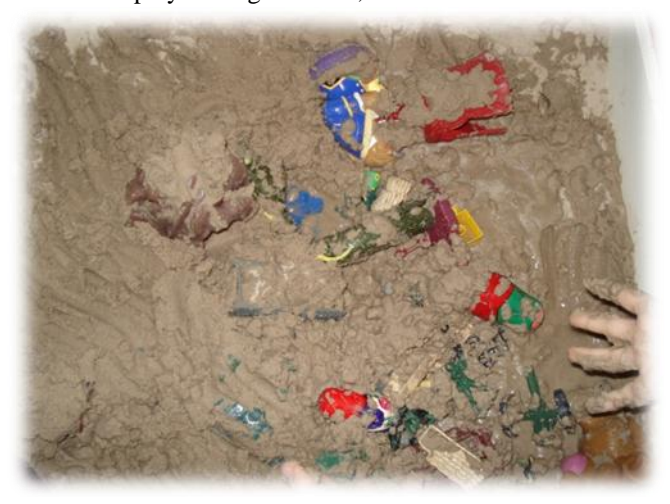
Figure 1. Early chaotic play

In the first three sessions, the boy was encouraged to play in a Sandtray. The photograph (Figure 1) depicts what was common in his play: disorganisation, chaos and a lack of order.