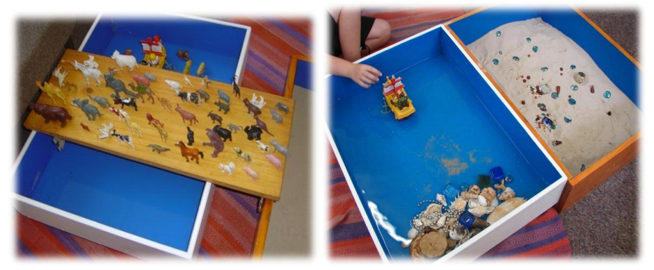
Figures 5 & 6. Organised play with deeper meaning.

personal view of the world became more organised he may have felt more in control, more able to manipulate the symbols and the sand to achieve a result with which he was satisfied.