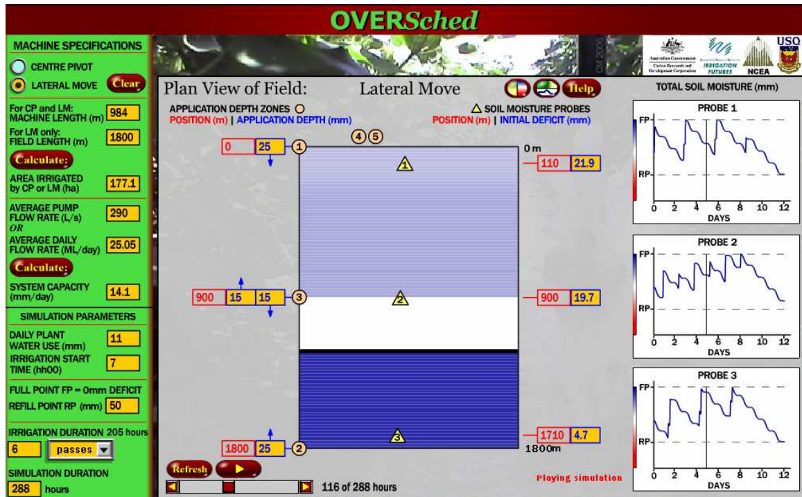
Figure 2. Graphical interface of the web-based CP&LM management tool OVERSched showing system capacity calculator on the left, with the lateral move irrigator graphic and the three corresponding moisture probe outputs on the right hand side.

management style. Recent developments as part of CRDC funded work on CP&LMs have included a graphical web based CP&LM irrigation simulation tool, OVERSched shown below in Figure 2.