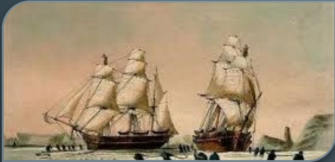
The hunt for the North-west Passage