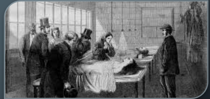
19 th century autopsy