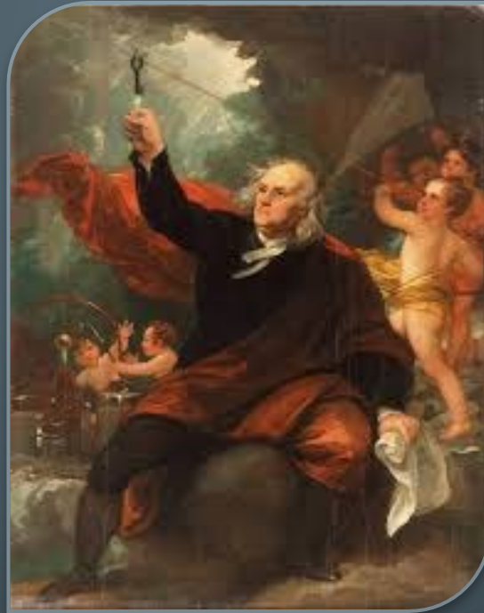
Benjamin Franklin experiments with lightning