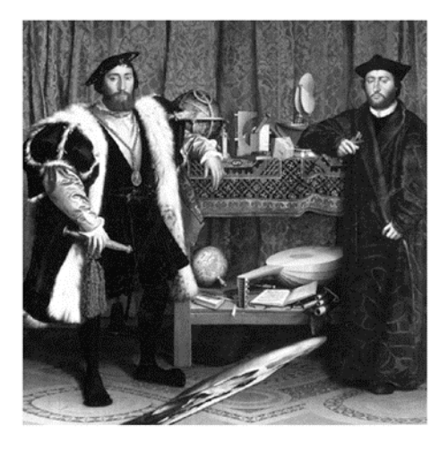
Figure 2. Holbein's Ambassadors [30].

"Objet a is the strange object that is nothing but the inscription of the subject itself in the field of objects, in the guise of a blotch that takes shape only when part of this field is anamorphically distorted by the subject's desire" ([29], p. 69). Zizek uses Holbein's Ambassadors painting (Figure 2) to add a visual layer/perspective to his description of objet petit a by saying "the most famous anamorphosis in the history of painting, Holbein's Ambassadors, concerns death: when we look from the proper lateral angle at the anamorphically extended blotch in the lower part of the painting, set amongst objects of human vanity, it reveals itself as a skull" ([29], p. 69). Zizek importantly notes the death symbolism of this painting and this is important because the analysand needs to pass through the death drive to remove the obstructiveness of a complex/ objet petit a (symbolised by the skull). Holbein's painting is another way of highlighting that discovering the meaning of a guilty mood from an unconscious obstructive complex [6] is to shift perspectives from desire to drive. This involves the death of the fantasy of objet petit a by discovering the missing possibilities from the readiness to hand to reveal the void of the barred subject.