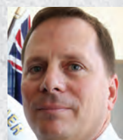
CDRE Brett Brace Hydrographer of Australia