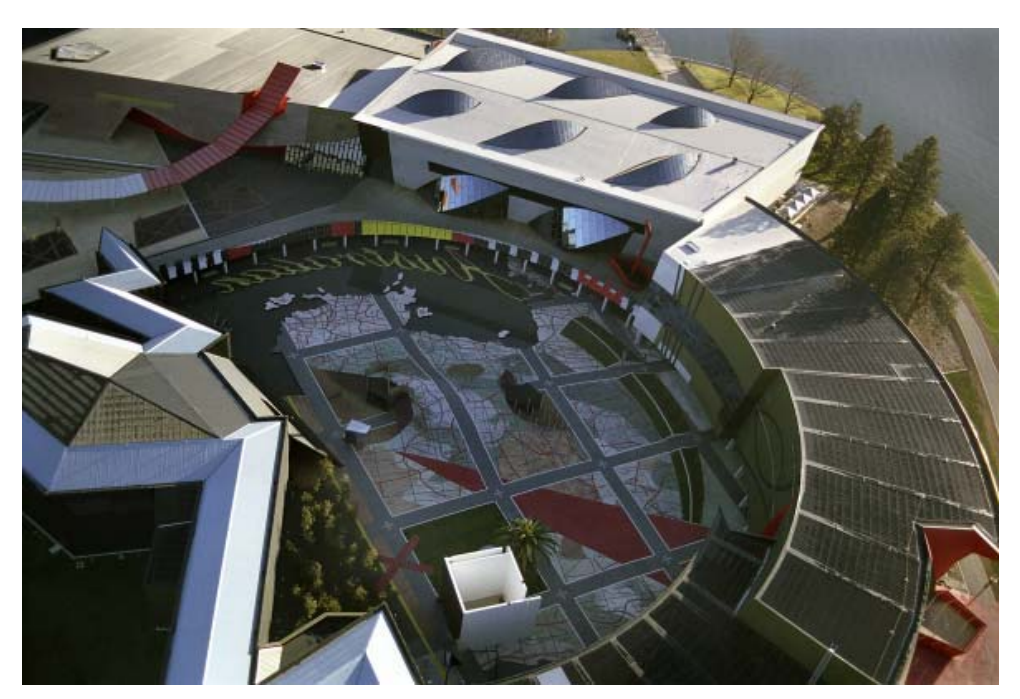
Fig. 4. The Garden of Australian Dreams, and the Gallery of First Australians [left]

The Gallery of First Australians (GFA) is the last space encountered in the NMA ( Fig. 4 ). It is located across from the Main Hall, separated by the Garden of Australian Dreams. The space is dedicated to Aboriginal and Torres Strait Island culture. In contrast to the other spaces, the Gallery is separated from the rest of the museum, and entered through a corridor. In this corridor is the multimedia installation Welcome Space , which serves as a symbolic initiation into the space. The degree of separation between the space of the GFA and the rest of the NMA is also present in the tone of the exhibition, where a much more serious tone prevails in the GFA. The GFA uses the form of Daniel Libeskind's JMB through a 'built shadow'. Here the JMB casts a shadow across the GFA, which is then enclosed in a volume. Interestingly, the reference to the JMB is only visible to people familiar with the building and who access aerial views of the NMA. The NMA's Gallery of First Australians differs from the JMB in appearance, size, materials and internal organization.