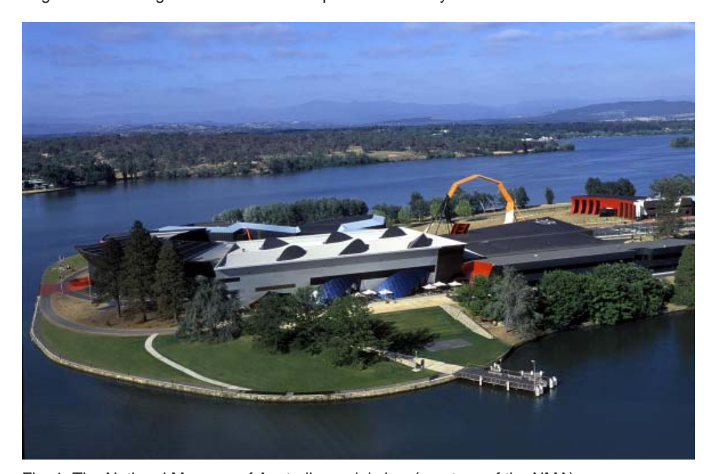
Fig. 1. The National Museum of Australia, aerial view.

The National Museum of Australia (NMA) is decidedly and deliberately an anti-monumental space (Fig. 1). Even the scarcest glimpse of the NMA's asymmetrical, de-centralized and fragmented building makes it clear that its space intentionally sets out to undermine associations