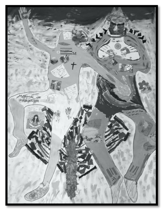
Figure 2: "My red heart"

The higher degree students also were worried about what would happen in terms of employment once they completed their studies. As post-graduate students they were all very passionate about their areas of study and making a difference in their communities. Their love of their home countries was a large focus in their reflective artworks.