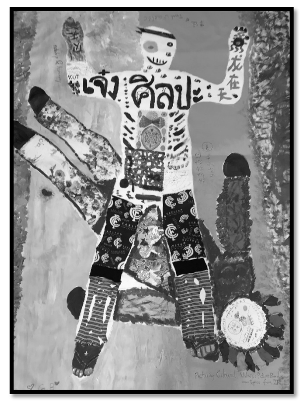
Figure 1: "Weak legs" 108

These reflections on the effects of COVID-19 on their lives as international students were reimagined on their body maps. Figure 1 shows a body map of a person with a white torso and blue and black covering on the legs. Of importance here is the bottom part of the pair of legs. The student reflected on his current situation and explained that he placed the black striped material on the bottom half of the legs and made holes in them to show, although his legs are strong, the isolation and uncertainty of COVID-19 is weakening him. The participant in this image also likened the striped material to his thesis drafts and the holes represented the edits his supervisors did to his work.