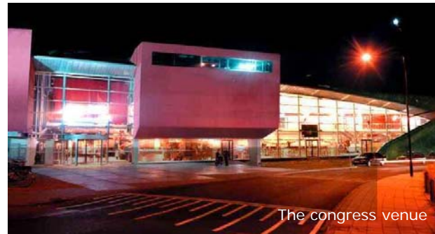
The congress venue

Over the past 25 years, the concepts and tools of Landscape Ecology have been established and developed. They are now widely applied throughout a range of research and applications from landuse change and sustainability to biodiversity and conservation planning, ecological networks and global change. Indeed, Landscape Ecological principles have been recognised as so important that they have been used to set national biodiversity programmes.