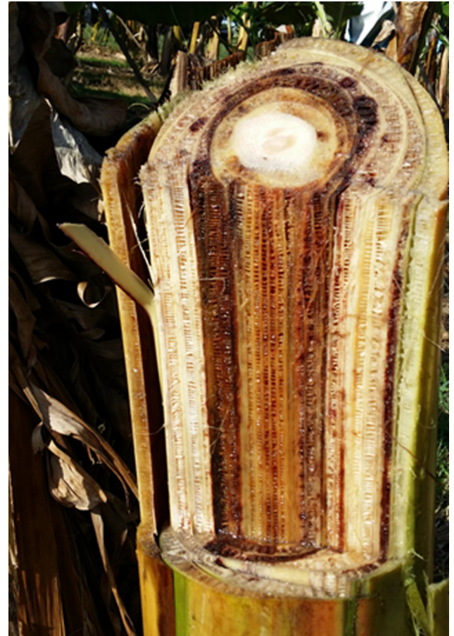
Fig. 2. Internal symptoms in pseudostem of banana variety Ducasse affected by Fusarium Wilt caused by Fusarium oxysporum f.sp. cabense Race 1, Duranbah Qld, 15 December 2015