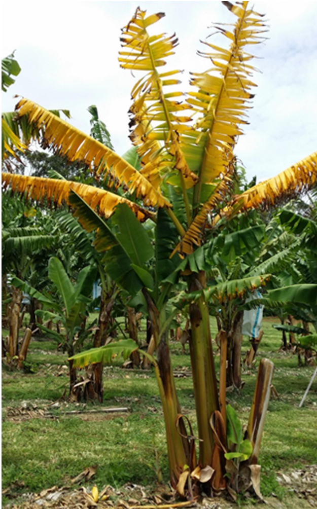
Fig. 1. Banana plants variety Ducasse affected by Fusarium Wilt caused by Fusarium oxysporum f.sp. cabense Race 1, Duranbah Qld, 15 December 2015, photo by Andre Drenth.

from healthy plants be grown in well manured and cultivated soil. 60 No wonder the growers were confused.