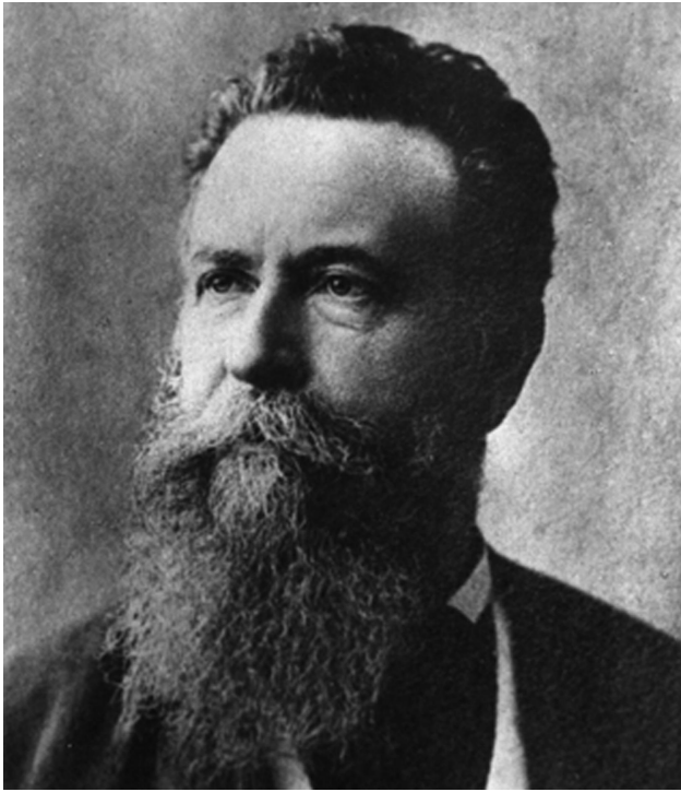
Fig. 3. Joseph Bancroft, 'eminent medical scientist, first in the world to discover the adult filarial worm in 1876', State Library of Queensland, Accession number: D1-12-89, https://hdl.handle.net/10462/deriv/71103 .

leaf sheaths. Internally in diseased stools, the 'spiral threads' were bright orange to mahogany, and the discoloration extended into the new buds which, if planted, would carry the disease. Small dark spots developed in the leaves (blades), ruby red spots and streaks were seen on the inside surface of the leaf sheaths and a purple discoloration was found in the cells of the lower parts of the sheaths. He also noted that many of the new varieties were affected by the disease but only the common banana died before fruiting. 64