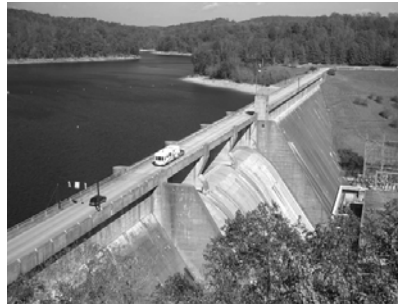
Figure 2: Human Dam

Animals are inextricable from the artefacts they produce (Hansell, 2007). This point, I suggest, should be clearly extended to humans and their work, particularly projects and project management. Consider Figure 1 and Figure 2. On the left, a dam built by Beavers, on the right a dam built by Humans. Just as the log dam is an extension of the Beaver as the dam is encoded in the Beaver's genes (Hunter, 2009), so too is the modern dam an extension of Humans as the dam is encoded genetically and memetically across our genes and culture. We humans, given certain environmental and geographical circumstances, have a propensity to build. Our culture, values, ideals, and technology, powerfully influence the nature of what we create and build and the manner or methods we adopt to perform those tasks. Modern project management is a product of Western cultural values and ideal, built on top of a predisposition to create and build (Whitty & Schulz, 2007).