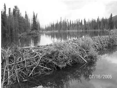
Figure 1: Beaver Dam