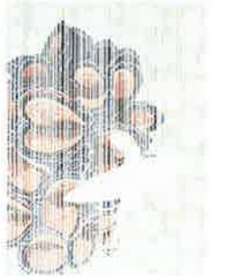
Ben Rak (NSW) True Blue screenprint 38 x 28