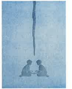
Travis Paterson (NSW) Campfire Stories aquatint 38 x 28