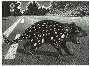
Rew Hanks (NSW) The Last Supper linocut 28 x 38