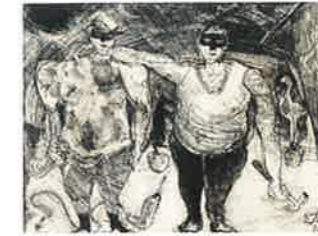
Ron McBurnie (QLD) Thick as Thieves etching & aquatint 14.8 x 19.8