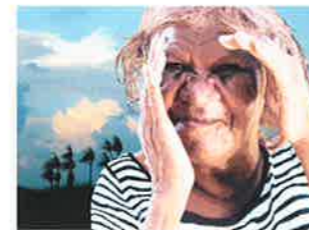
Therese Ritchie (NT) You Know Me inkjet print 28 x 38