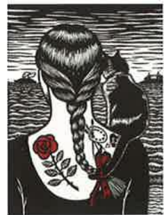
Deborah Klein (VIC) Looking back to see... linocut & hand colouring 38 x 28