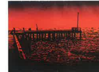
David Rosengrave (VIC) Untitled woodcut 22.5 x 30