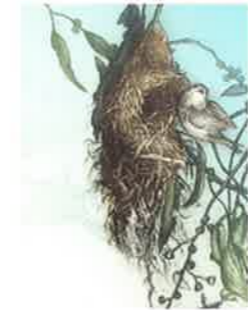
Bruce Latimer (NSW) Two Birds etching 25 x 19