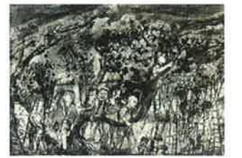
Lorelei Medcalf (SA) The Garden etching 21 x 30