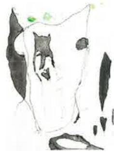
Liam Garstang (NSW) The Dream Still drypoint 38 x 28