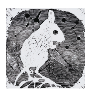
Heather Shimmen Blindside 2020 linocut 30 x 30 cm represented by Australian Galleries