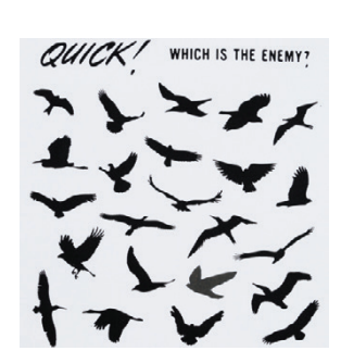
Katy Mutton Quick! 2020 screenprint & thermochromic pigment 38 x 38 cm katymutton.com