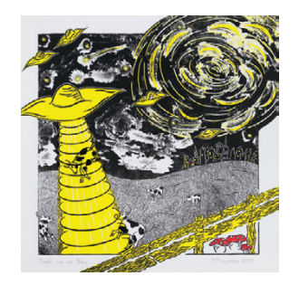
Michael Reynolds Beef me up 2020 linocut 38 x 38 cm