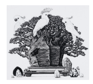
Michael Kempson Apex Predators 2020 etching & aquatint 25 x 28 cm represented by Flinders Street Gallery