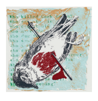
John Robinson Why? 2020 screenprint 26 x 26 cm movingcreaturestudio.com