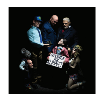
Neale Stratford A Lesson in Coal 2020 inkjet pigment print 25 x 25 cm nealestratford.com