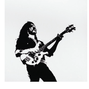
Aaron McLoughlin Ace of Spades 2020 linocut 38 x 38 cm printed by Rona Green