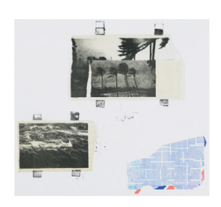
Clare Jackson letter '87 2020 etching, aquatint, lithography & screenprint 26.5 x 30 cm clarejackson.weebly.com