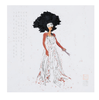
Rujunko Pugh Fanon's Angel 2020 screenprint 38 x 38 cm rujunkopugh.com