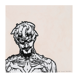
Freya Jobbins Deviant 2020 hand coloured linocut 38 x 38 cm freyajobbins.com