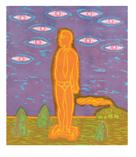
Peter Ward Fish Whispering 2020 linocut 28 x 24.5 cm peterwardprintmaker.com