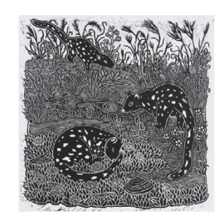
Otto Macpherson Quolls 2020 linocut 29 x 28 cm @otto_macpherson_