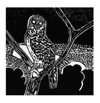
Cassie May Powerful Owl 2020 linocut 28 x 28 cm printed by Rona Green represented by neospace