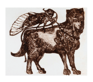
Angela Nagel The Sublime Messenger 2021 drypoint 22.5 x 27 cm angelanagel.com