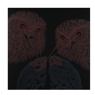
David Rosengrave The owls are not what they seem 2020 linocut 38 x 38 cm davidrosengrave.com