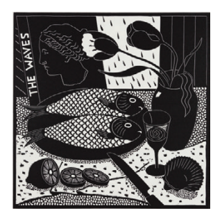
Allie Webb The Waves 2020 linocut 38 x 38 cm alliewebb.com.au