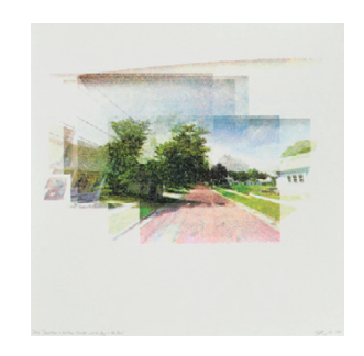
Tim Pauszek Street View in Isolation (Grandpa and the Dog on the Porch) 2020 screenprint 38 x 38 cm