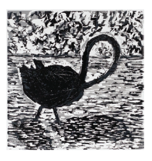
Julian Twigg Itchy 2020 Iinocut 19 x 19 cm represented by Australian Galleries juliantwigg.com