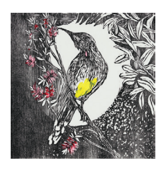
Julian Laffan Return of the Wattlebird (After the Fire) 2020 hand coloured woodcut 38 x 38 cm represented by Beaver Galleries julian-laffan.squarespace.com