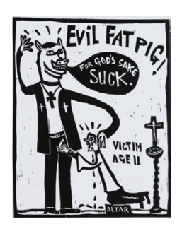
Glenn Morgan Evil Fat Pig 2020 linocut 30 x 24 cm represented by Australian Galleries