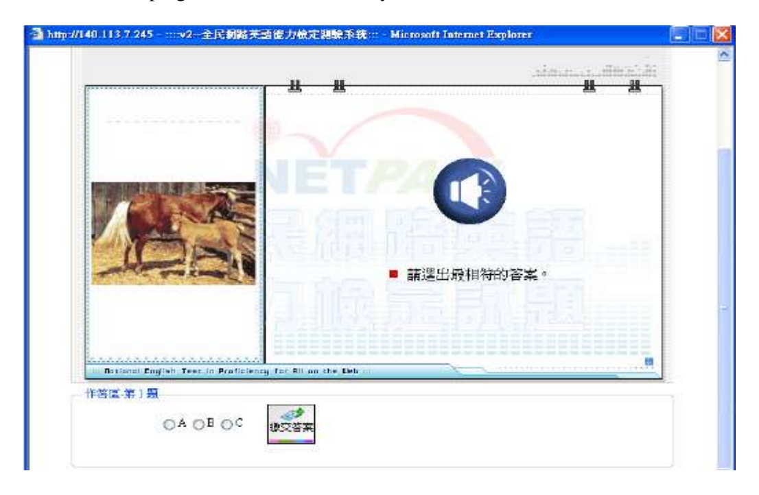
Figure 2: NETPAW Basic Level listening task

The speaker then asks "What are Mike and Alice discussing? The testee needs to read the possible four short answers of two or three words and use the mouse to select their preferred choice. This skill demand is to listen to a short two-way conversation and identify the topic . These are in keeping with the skills tested by DELTA test.