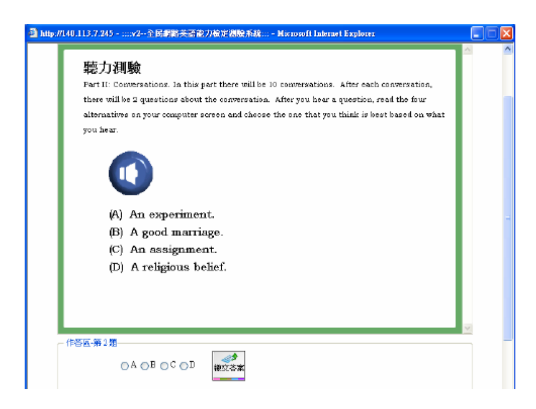
Figure 3: NETPAW High-Intermediate Level listening task

When the NETPAW reading test is considered the approach to content and comprehension questions are comparable with DELTA. Both test are diagnostic in their ability for instance to differentiate between students ability to read and understand shorter and longer written texts that are likely to be familiar in content. They are similar in format except NETPAW is online. Similarly, they differentiate levels of skill difficulty. This is for example, with respect to testees' ability to understand the main point of a short text; to read for explicitly stated, specific information; skim for the main idea, understand pronoun reference, use information gained from a written text to infer attitude or opinion and understand cause and effect.