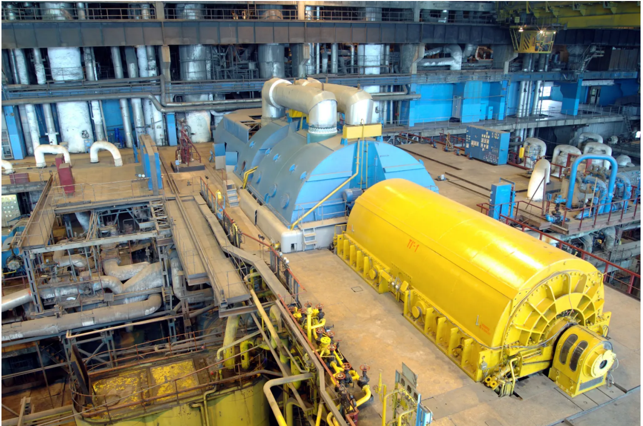
Thermal power plants rely on giant steam turbines.

These technologies are rapidly becoming important sources of energy and storage. But steam isn't going away. If we use thermal power plants, we'll likely still be using steam.