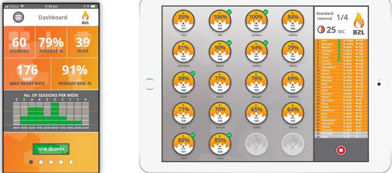
Figure 2 Snapshot of Burn 2 Learn (B2L) smartphone application dashboard and group session.