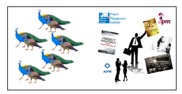
Figure 1: Gene vs. Meme Environment

In the early stages of peacock evolution (when their ancestors looked very little like the present day bird), all offspring were (and still are) slight variations of their parents because the replication of their genes is not 100% perfect. Some will be fitter and more biologically stable than others. Some fit and healthy peacocks channel energy into growing plumage and survive long enough to reproduce with the peahens who are attracted to them, and this plumage growing and being attracting to plumage trait get passed on to offspring. The tail becomes 'wired in' to both the peacock and the peahen. I will return to this 'wired in' concept shortly when I discus the particular meme of the Gantt chart.