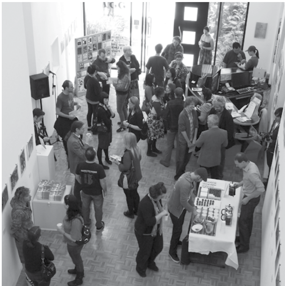
Bizoo book launch at Toowoomba Regional Art Gallery 2011

The Regional Arts Development Fund (RADF) is a highly successful state and local government partnership that supports professional and emerging professional artists and arts practitioners living in regional Queensland. The RADF program focuses on the development of quality art and arts practice for, and with, regional communities. RADF is a partnership between the Queensland Government through Arts Queensland and Councils to support local arts and culture. All 55 eligible Councils in Queensland are participating in the RADF Program. Fund guidelines and application forms are available from the Arts Queensland website www.arts.qld.gov.au/funding/radf.html or from Toowoomba Regional Council's customer service centre on 131 TRC.