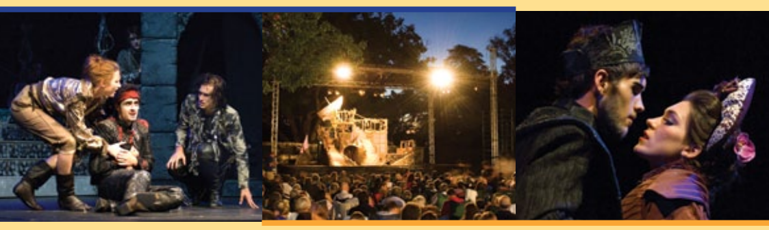
Design: USQ Graphics 11-920