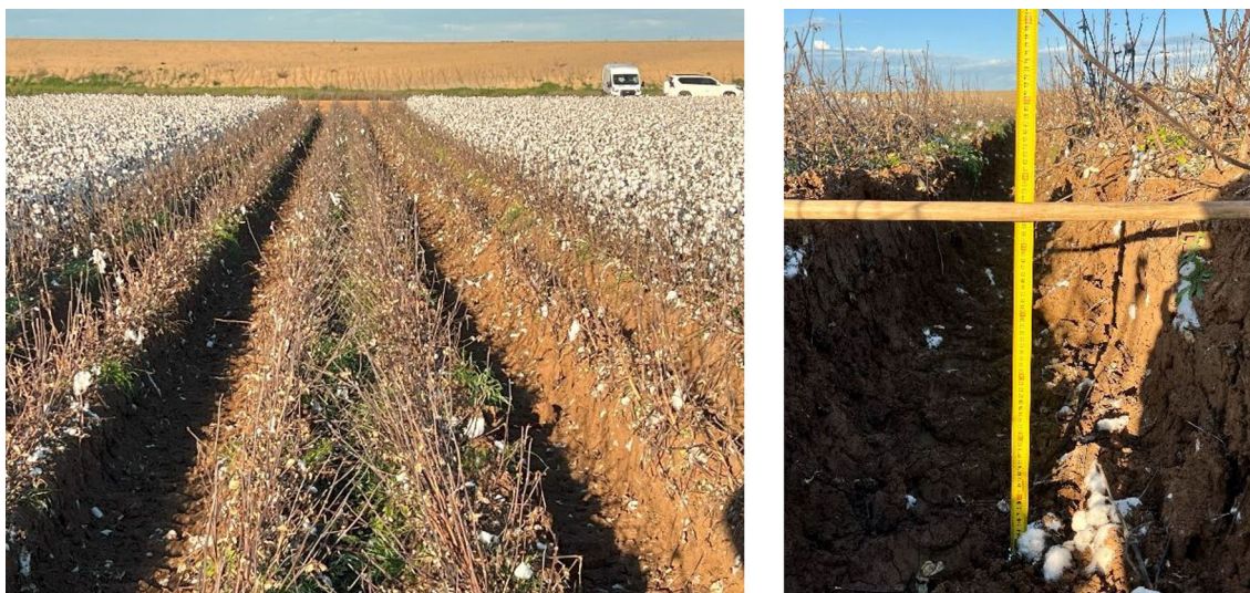
Fig. 1 Large rutting caused by a cotton picker while harvesting on soft soil in 2024 near Griffith (New South Wales, Australia). The cotton picker was fitted with dual tires (520/85R42-R1, average wheel load: 5.43 Mg, inflation pressure: 2.5 bar) on the front axle and single tires (520/85R34-R1, average wheel load: 8.25 Mg, inflation pressure:

3.2 bar) on the rear axle. At the time of traffic, the soil was near drained upper limit ( \sim 100 cm suction) and had a soil water content of \sim 24\% (by weight). The maximum rut depth, measured at the centerline of the tire rut, ranged between 370 and 560 mm.