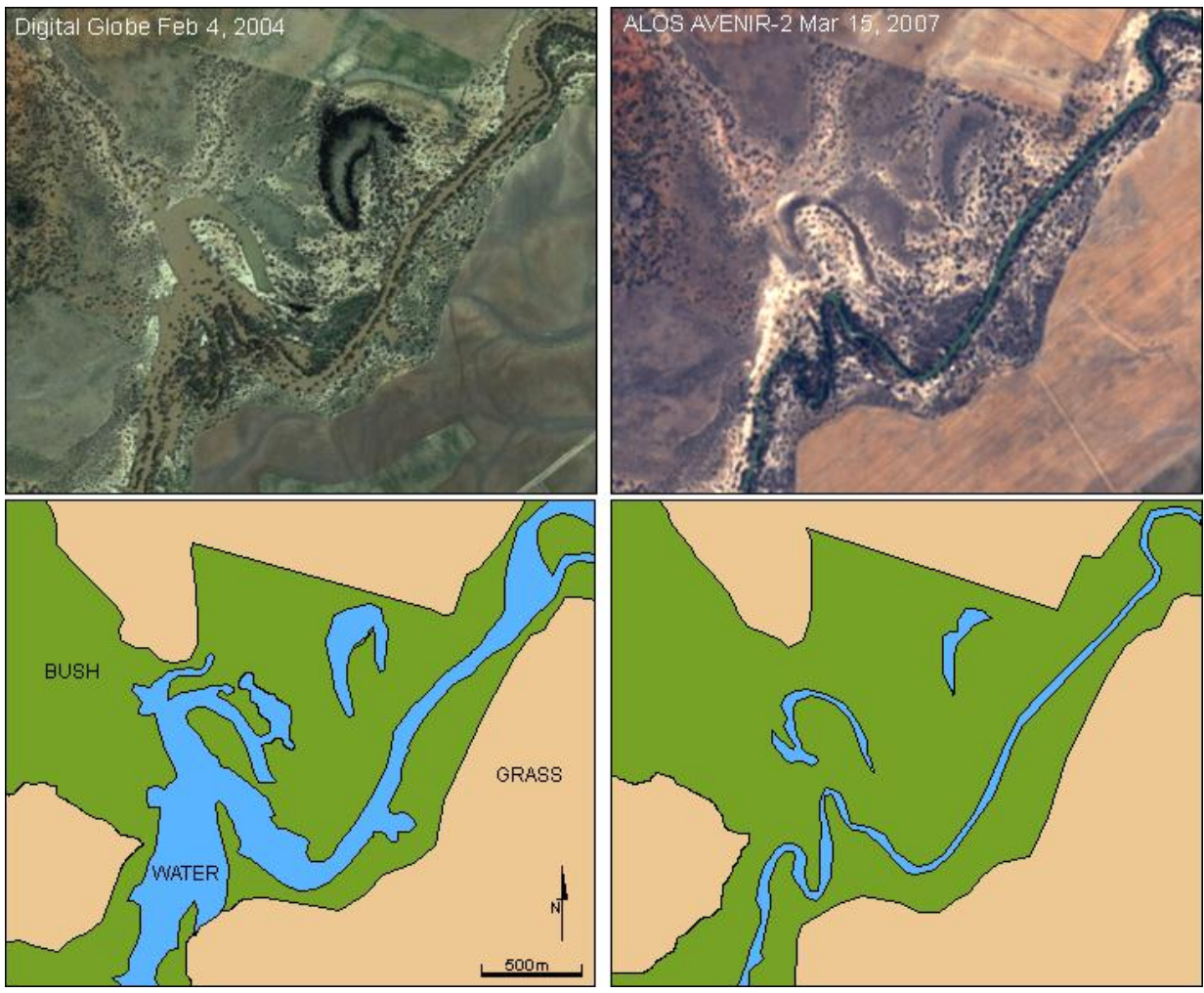
Figure 3. Visually interpreted images clearly show the changes in wetland and the human impact on the land surface, where large scale clearances have turned bush into grasslands.

(2004) and ALOS AVNIR-2 system (2007) (Geoscince Australia, 2011 and Google Earth, 2011) over an area closer to Collarenebri, NSW. The ALOS image was interpolated into Digital Globe image resolution for visual interpretation. The high to very high spatial resolution of the image displays the river, lake, expansion area of the lake and land cover in vicinity in fluctuations of rainfall. Images were selected to represent a wet season and a dry season (see table 1).