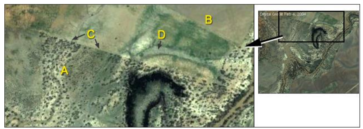
Figure 4. The impact of land clearance on wetlands and clay pan lakes (A=Bush, B=Grass, C=boundary of clearance, D=affected wetland of section of the clay pan lake)

basin. These changes may cause significant phenological changes in clay pan lake environment. According to a CSIRO report (Scott, 1997), monitoring the habitat of wetlands needs long-term involvement. Even though satellite images are not capable to directly identify wetland habitat, the regular monitoring of land cover conditions will provide a voluble data source for most of the other studies dealing with wetlands. Apart from extreme climate impact, images showed the extensive clearance in bush (savannah type vegetation) around wetlands. Figure 4 shows these land cover changes in a close-up view of a sub-section of 2004 image.