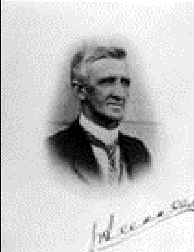
Aboriginal Chief Protector

Aboriginal people lost British legal status and became wards of the state.