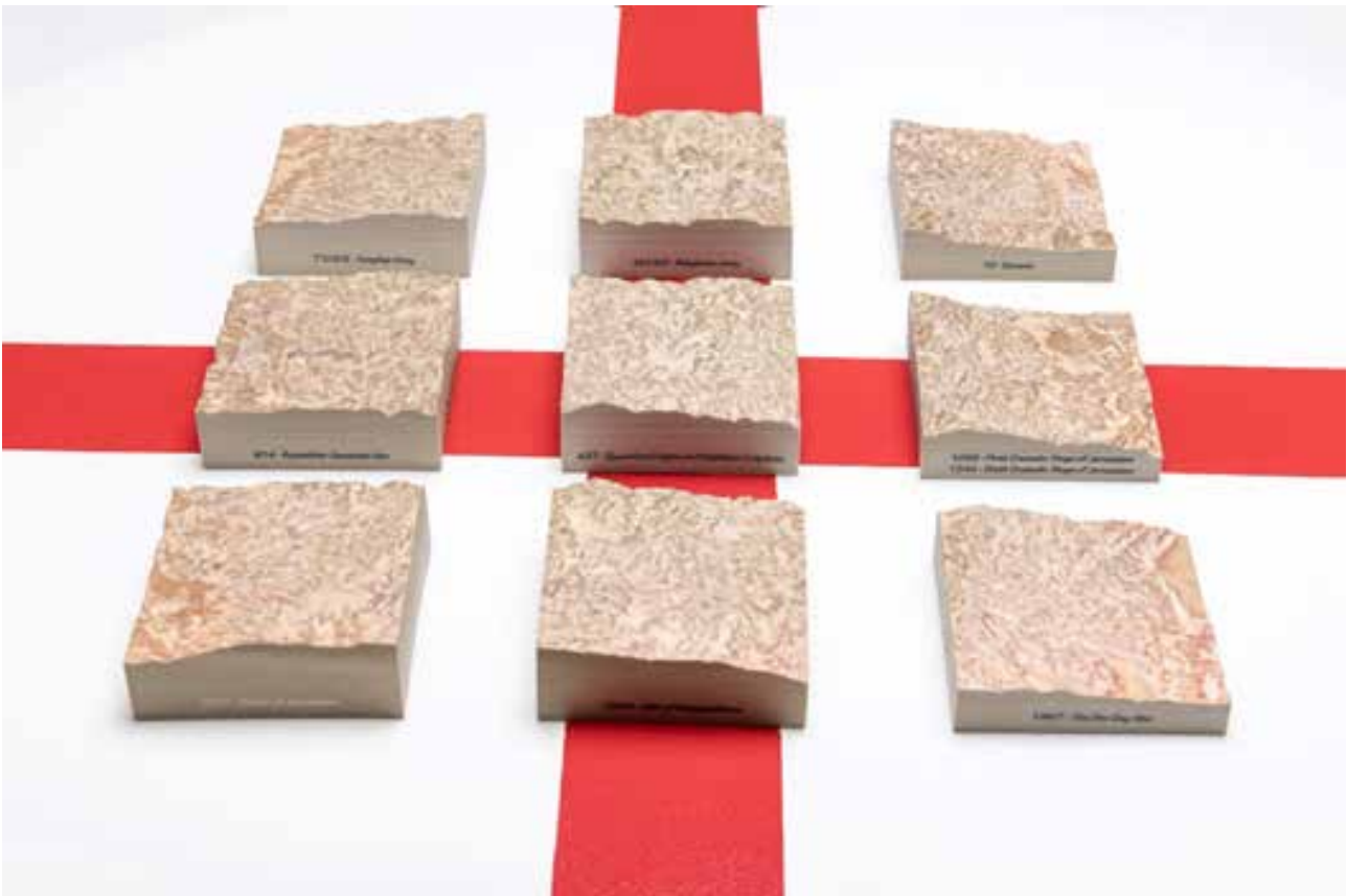
Margaret BAGULEY / It came upon a midday clear – The Battle of Jerusalem 1917 (detail) 2018 Wood, enamel paint, 3D printed tiles and upholstery pins / 90 x 2 cm

In exploring Hurley's use of landscape by using a contour map of Jerusalem, Baguley allows the viewer to engage with the landscape while still facilitating a sense of apartness. The viewer can slip the surly bonds of earth, and if not quite touch the face of God, certainly can at least consider the Middle East as a product of a long historical process. It is a land, like Australia, that is at once very old and very new, given that the national borders are artificial constructs imposed after the First World War. Baguley's vantage point was one that was familiar to Hurley. In a flight in a Bristol fighter flown by famous aviator Ross Smith in February 1918, he was deeply moved by what he saw: