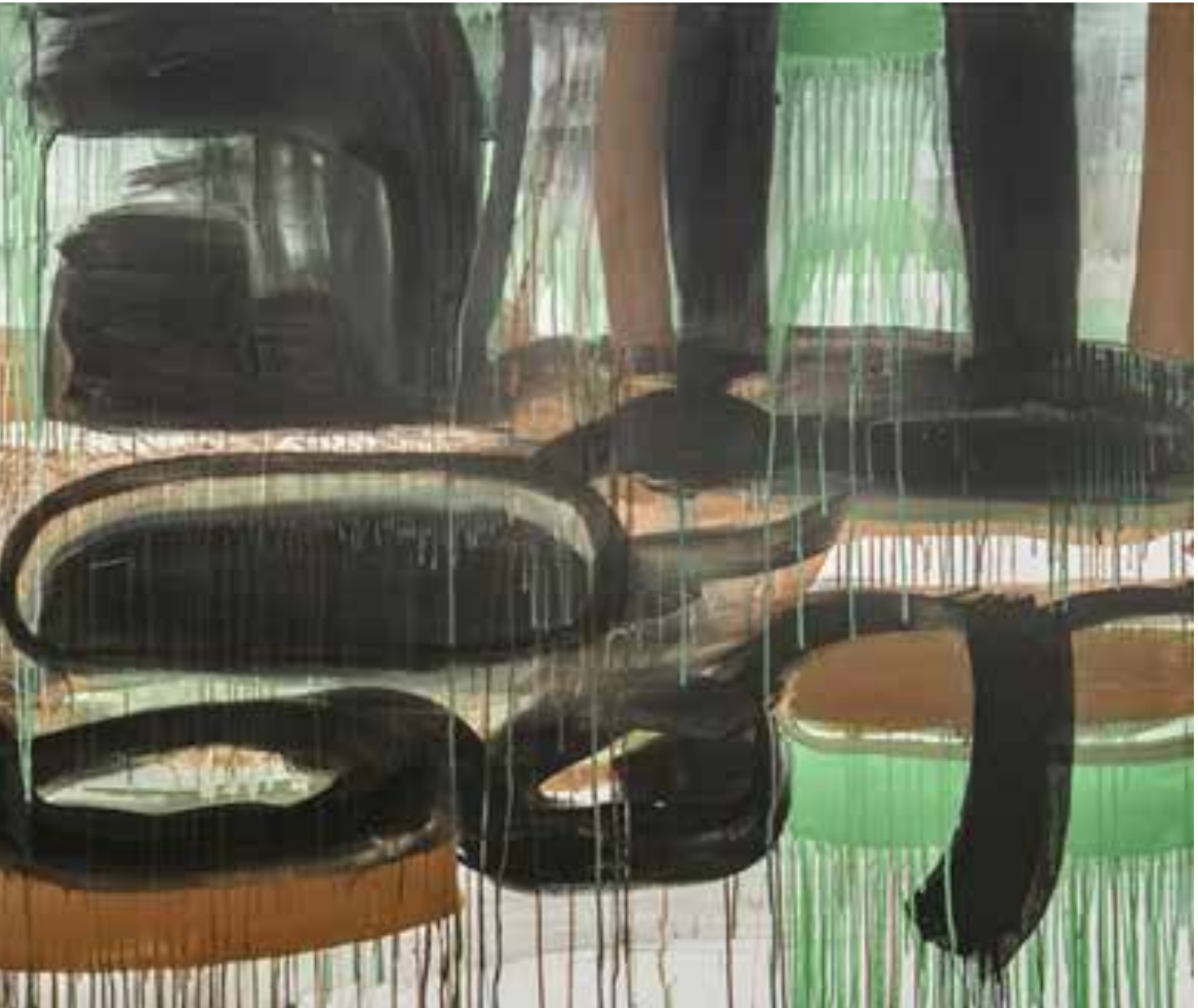
David USHER / The Weight of the World 2018 / Acrylic and oil on canvas / 160 x 280 cm

The de-rationalised and de-familiarised work of Armstrong is noticeably absent in Usher's work. Rather, the soldiers and other evidence of human occupation are erased, yet their ghosts echo in the dominating landscape of thick black outlines, brown overflowing pools, and what seems like an endless drip of ambiguous green. In articulating the scale of violence and destruction that the First World War wrought