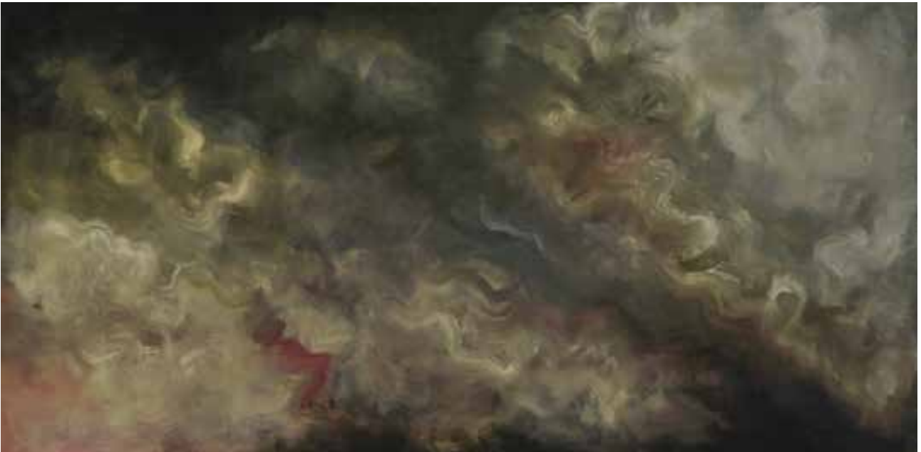
Abbey MACDONALD / Act 3: Rebuild the stage 2018 / Oil on canvas / 40 x 70cm