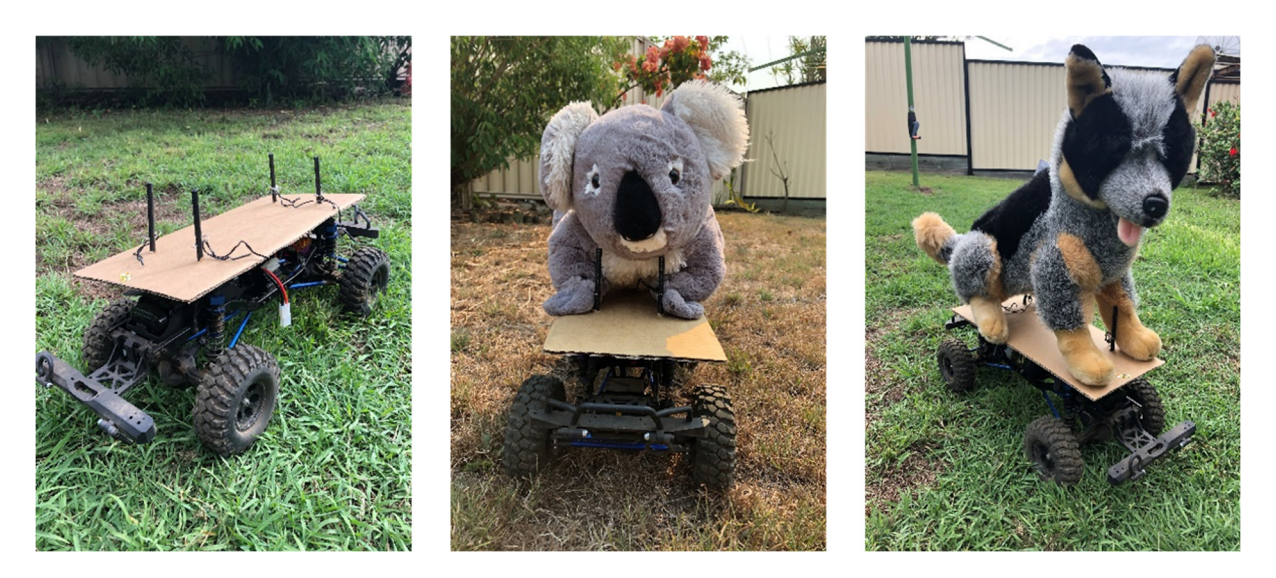
Figure 2. The three treatments (from left to right): Car, Koala and Dog, used to test the response of cattle to koala and dog models.

The cattle (Droughtmaster and Charolais crosses, four to ten years old) were categorised into five classes: (1) non-lactating cows (NLC)—single cows which had previously bred, (2) lactating cows with old calves (LCO)—cows with dependent calves that were between eight and ten months old, (3) lactating cows with young calves (LCY)—cows with dependent calves that were less than three months old, (4) heifers (HF)—young adult cows about one year old without any breeding history, and (5) adult bulls (BL). The numbers of cattle herds tested in each class and the numbers of animals in each herd are shown in Table 2. Calves were dependent on their mothers, so the two lactating cow classes had 20 animals (10 cows and 10 calves) in each herd. As only seven adult bulls were available on the OHV property (for breeding purposes) they were divided into three herds with two, two and three bulls in each herd.