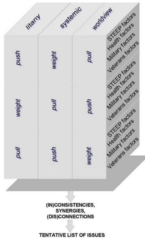
Figure 3. Mapping the data and first analysis: Matrix of factors by CLA, STEEP-plus and Push-Weight-Pull categories