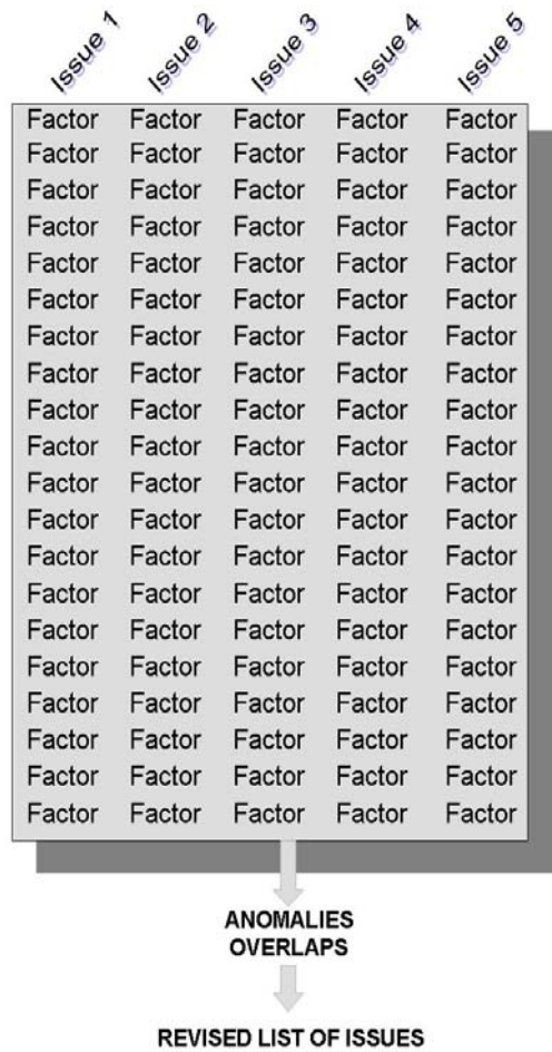
Figure 4. Factor-tagging table: second analysis