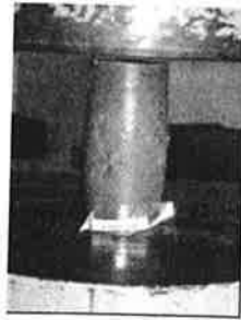
Figure 1. Compression testing