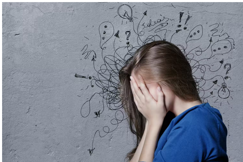
One American University regards the term 'trigger warning' as potentially triggering.

One American university now regards the term "trigger warning" itself as triggering, increasing anticipatory distress and reinforcing unhealthy avoidance behaviours.