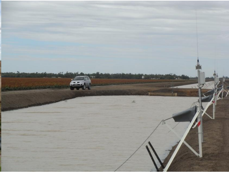
Figure 2. Automated (PTBs) for furrow irrigation.