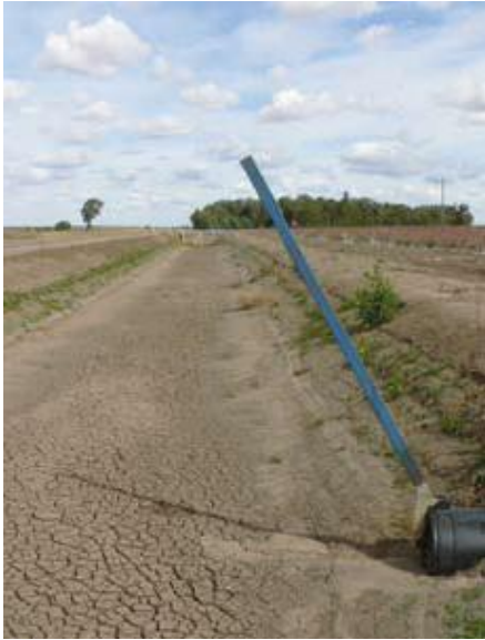
Figure 1. Manually operated PTB.