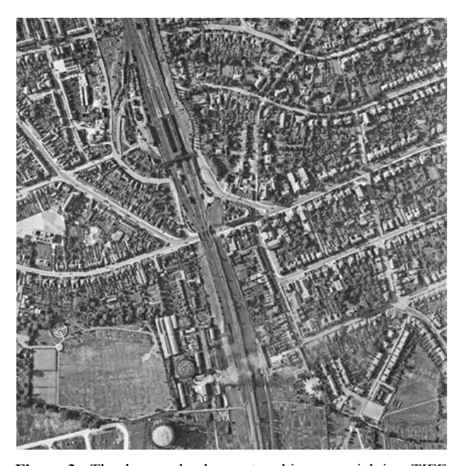
Figure 3 - The deconvolved or restored image aerialview.TIFF

The restored aerial image was statistically compared with the original aerialview.TIFF by way of calculating the RMSE of the difference between the original aerialview.TIFF and the restored version. The RMSE in this case was +/-2.75 pixel intensity values with maximum and minimum differences of -3.8 and 2.9 pixel intensity values.