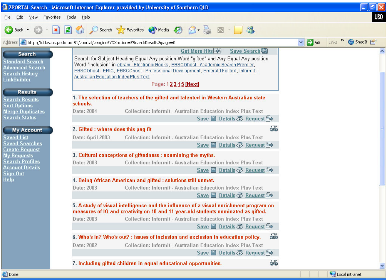
Figure 3: Results screen from a federated search on Education resources in DocEx

So a common scenario may be that when an off-campus client signs-in and get the initial DocEx search screen, their first choice will be either to search just the USQ Library catalogue, or search the business journal databases – or some may prefer to search them both simultaneously. In any search results that display, direct links will be present for any full-text online item and if not available online, the client then has the option of clicking on the "request" button to create an off-campus or interlibrary loan request.