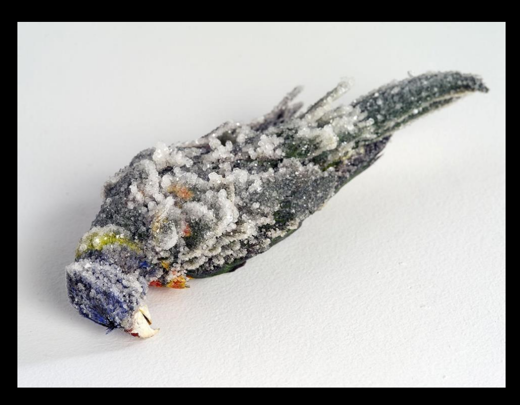
Ellie Coleman, Lucent Creatures VII, 2018, Taxidermy Rainbow Lorikeet, lab grown crystals 5.0 \times 24.0 \times 8.0 cm