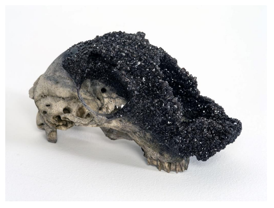
Ellie COLEMAN / Lucent Creatures V / pig skull, lab grown crystals 15.0 \times 28.0 \times 17.0 \text{ cm}