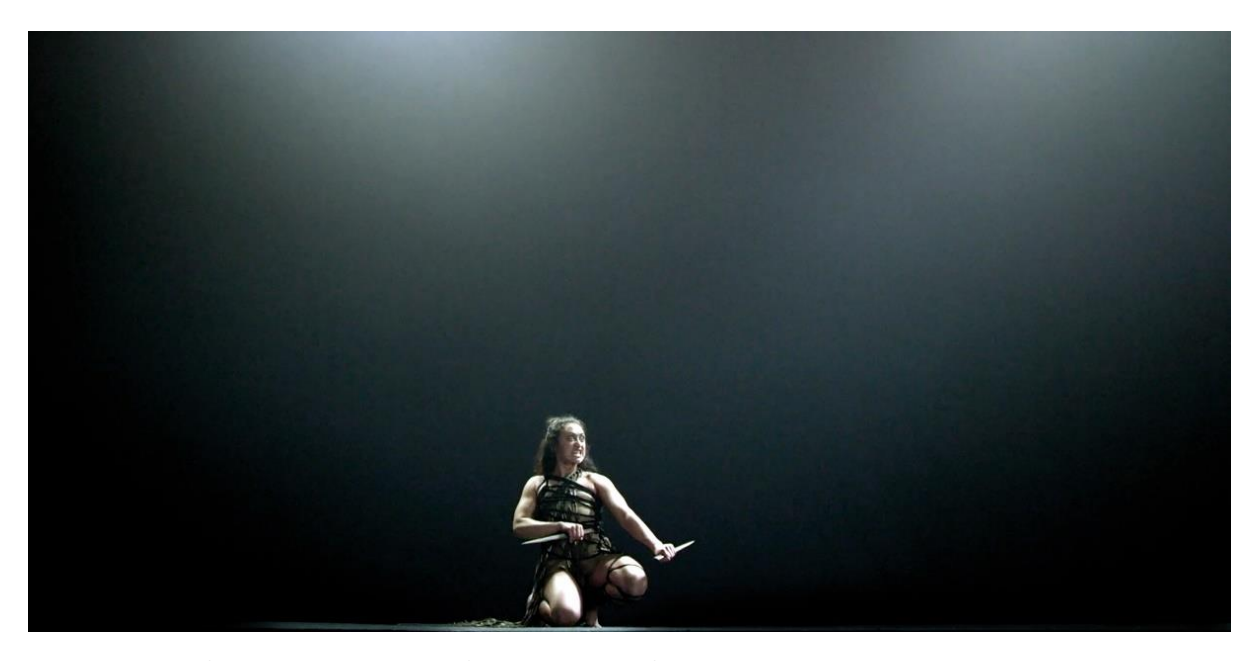
Lisa REIHANA / Beware sacred spaces / production still / single channel colour ultra high definition video in 3D transferred to media player, stereo sound / 2018