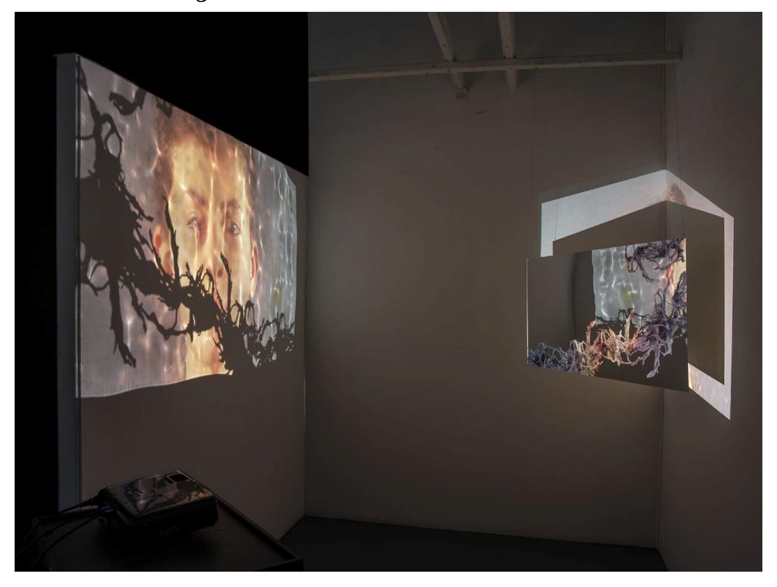
Linda CLARK / Bearing Witness / single channel colour video, stereo sound, inkjet water decal transfer, acrylic mirror, wire / dimensions variable / 2018