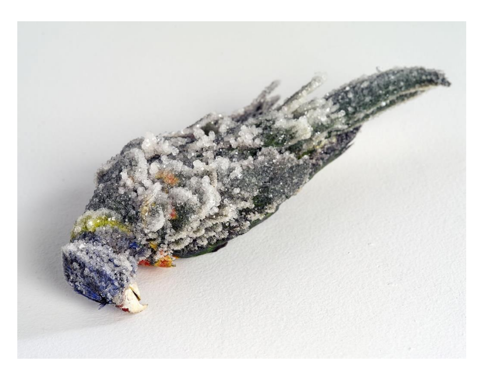
Ellie COLEMAN / Lucent Creatures VII / Taxidermy rainbow lorikeet, lab grown crystals/ 5.0 \times 24.0 \times 8.0 cm