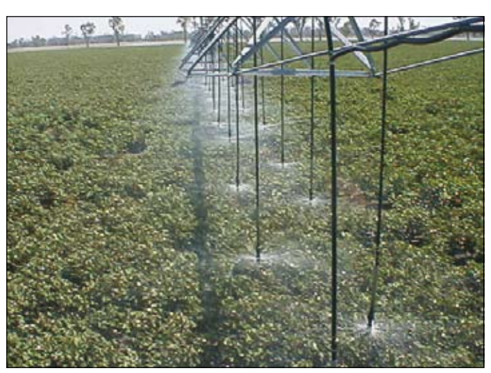
Myths abound about the proportion of water lost in flight.

With the LEPA bubblers operating approximately two feet from the ground, the dykes tend to wash down after seven or eight irrigations, resulting in the need to build the dykes a second time to prevent water movement towards the end of the season. This problem could be prevented with double ended LEPA socks, but their short life span was not favoured by Craig.