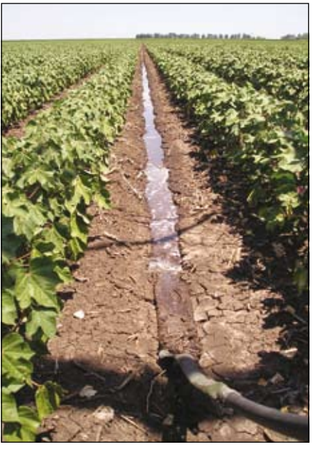
Most growers use a LEPA system.

Carl and Steve have previously used a ...49 >