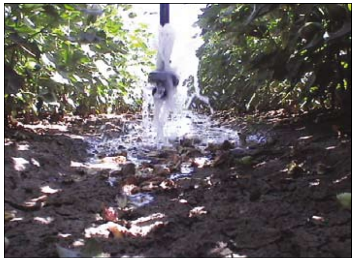
Emitters in bubbler mode.

crocodile cultivator (or "paddle popper") to place divots across the field to catch sprinkler applied water when planting cotton onto freshly cultivated bare fields. They felt that the divots were useful until mid-season but had often washed down by the later stages of the crop.