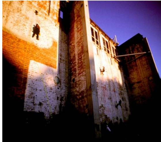
Writing the City 4.

performative as the writers abseiled across the façade in front of crowds of people. It was also on the evening news and was the subject of live radio broadcasts. This gigantic and dynamic drawing was about place and story.