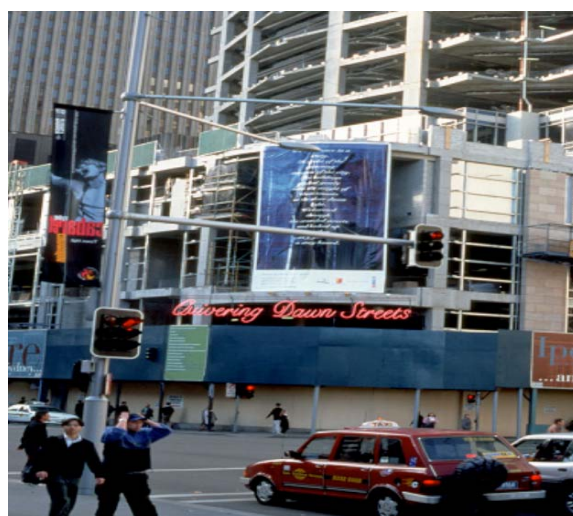
Writing the City

The creation of artwork as both method and outcome for research is often difficult and requires much more time than I seem ever to have ... positions me as the artist scoping the creative involvement within the political structures and the physical building surfaces that are the breathing skin of the public places of the City. This type of public project leads to the creation of its own myths and stories ... a desire to create artworks that explore the rub of public space against public politic through walking those spaces.