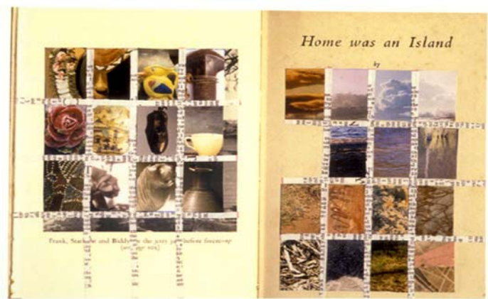
Home was an island.

The work I have produced over the last twelve years has moved from a reasonably objective position to one of conscious subjectivity. This could be described as a shift from approaching the subject from a supposedly universal reference point to one of using self to approach the determining forces of such referencing points (p.36)