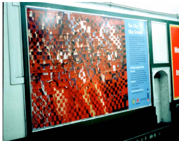
Writing the City 1: Fictional Cities.

I began informal research several years ago on the intentional and unintentional effects of what I term as mega-events on the design of public space; its perception and understanding. Beginning with a stray thought that occurred after looking closely at some of the reactions to my own public art works. I was interested in the ways that people remembered these specific art events, long after the lights had gone, the sound disappeared and the installation was taken down.