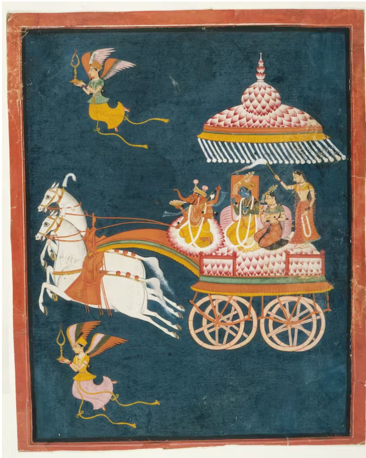
Krishna and Rukmini as Groom and Bride in a Celestial Chariot Driven by Ganesha, India, Rajasthan, Bundi, 1675-1700. Los Angeles County Museum of Art

Describing portents of the winter of 218 BC, the Roman historian Livy said a “spectacle of ships gleamed in the sky”. The Second Punic War had begun, and the enemy general Hannibal was on the verge of a series of victories.