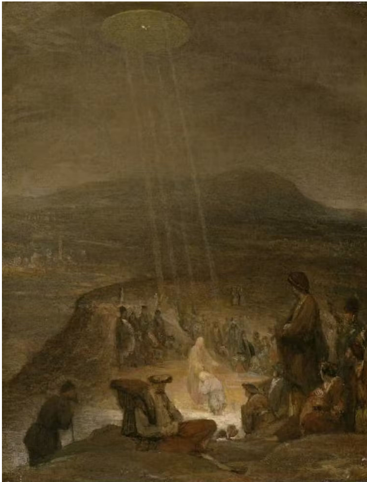
Arent de Gelder (1645–1727), The Baptism of Christ .

Whatever it was, both armies thought it was a bad omen and withdrew.