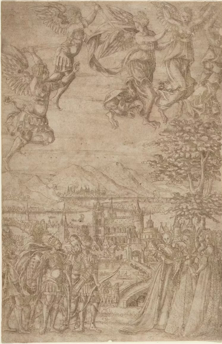
A King and His Retinue Confronting Ladies under a Celestial Battle, French, c. 1600. The National Gallery of Art

Millennial ufology is a fascinating development of recent Christian predictions of the end of the world, where the Messiah poses as a space traveller who returns to save us from Satanic aliens.