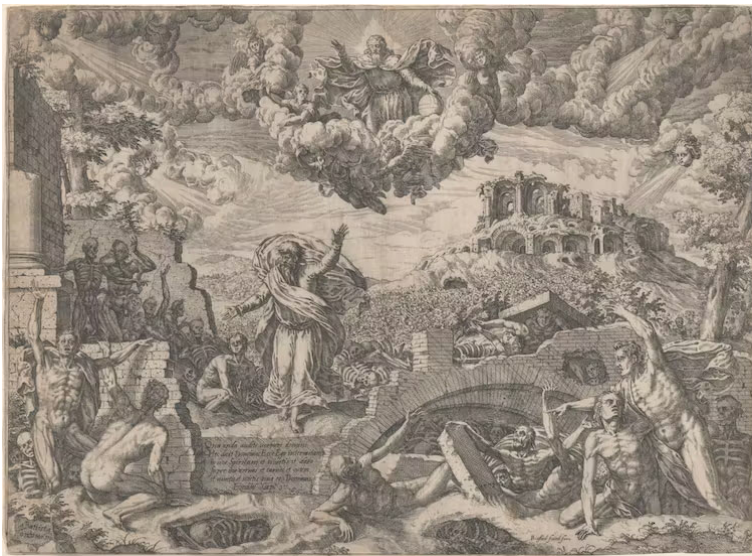
Giovanni Battista Fontana, The Vision of Ezekiel, 1579. The National Gallery of Art

In the Bible, the prophet Ezekiel mentioned a divine chariot: it glowed like hot metal in a fire and Ezekiel could see four living beings in it. They looked human-like, though they had four faces and four wings.