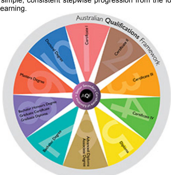
Diagram One: The Australian Qualifications Framework Wheel

No longer is it expected that a person's original training or qualification will be the primary basis of what they do at work over their working life. This is the context within which the AQF has been developed. The primary intent of the AQF is usually illustrated as a wheel with equal segments given to each of the ten levels from leaving high school [Level 1] to the highest academic award [Level 10] (AQF Council 2013). The thrust of the AQF is directed towards supporting a learner's journey, through time, around the wheel (See Diagram One below). All segments are depicted as being equal in size and joined to the next one. Such illustrations convey the impression of a simple, consistent stepwise progression from the lowest level to the highest level of learning.