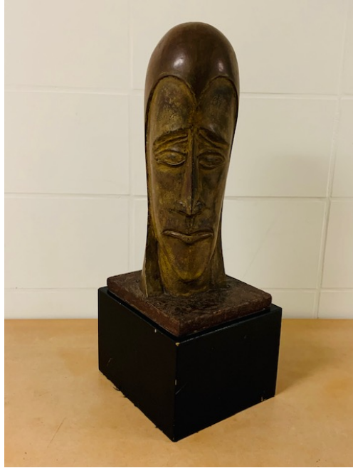
Figure 2. Sculptural work by George Lewkowich (David's grandfather)

In our second meeting, we began with a discussion about the aesthetic and thematic qualities of InstaPoetry, looking at examples of such work by Rupi Kaur, Amanda Lovelace, and Lang Leav. I then asked participants to share their poetic responses to Fayolle's drawing, subsequently asking what they might do if they were to change their poems into Instapoems. As another mode of response, we then moved into a discussion of collage, and I described this artistic practice in three steps: selection (of materials); deconstruction (cutting, tearing, etc.); and connection/recombination. After sharing an example that I had created in response to a poem by Ocean Vuong, I asked participants to give their poetic response to another person, who would use this response to craft a collage. Participants spent the rest of this meeting choosing materials from a number of magazines I had brought in.