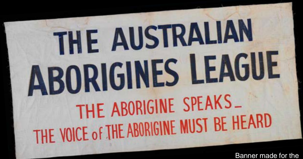
Banner made for the Australian Aborigines League, c. 1940s

In 1897, the Aboriginal Protection and Restriction of the Sale of Opium Act was passed authorising the removal of Aboriginal people to reserves. Many Aboriginal peoples refer to this time as being 'under the Act'.