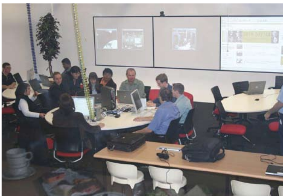
Figure 4. TELL in use for group brainstorming sessions (Photo taken from Observation room)

learners who can usually identify their needs, prefer flexibility, but need some structure and support. In addition, experiences that are isolated and unrelated to the “now” can be irrelevant for these learners. Adults also need to be able to reflect – on the activity, on the learning environment, on their interactions with others and then relate it to what they already know and do.