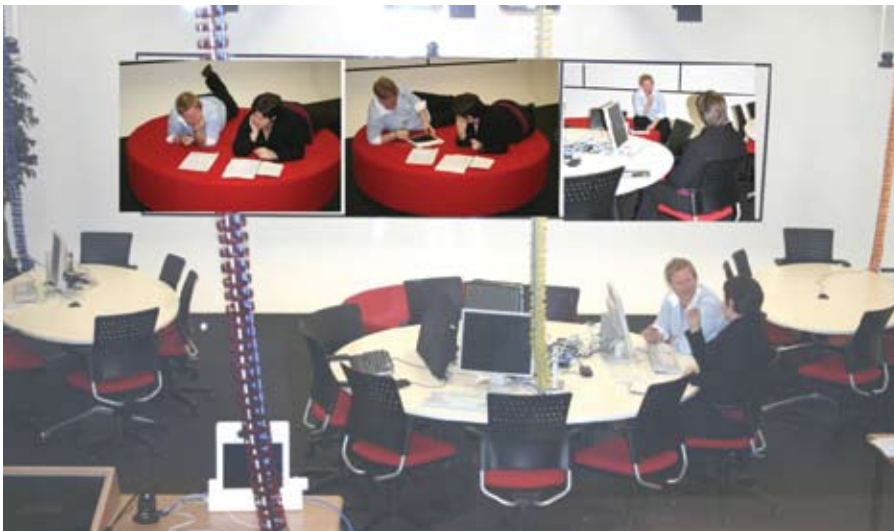
Figure 1. TELL furnishing (Photo taken from Observation room)

workstations offers a choice of operating system (Windows and Linux) and image (USQ Staff or Student Lab) where three groups of three can work. This use of the work space for collaborative activity aligns with the findings from the MIT Technology-enabled Active Learning (TEAL) project ( http://icampus.mit.edu/teal ). Other work spaces include two large oval tables with power outlets and ergonomically designed chairs, a circular padded couch for group-based activities, and two long high movable tables (with stools) with multiple outlets to support the connection of electronic devices. The choice of furnishings and floor treatments has aimed to create a contemporary, welcoming environment. Furniture configurations can be seen in Figure 1.