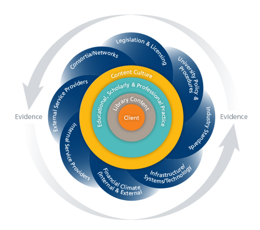
Figure 1: USQ Library Content Framework

Content Management Framework for USQ Library – This strategic document written by the Associate Director (Content) articulates the role USQ Library must play in moving from the traditional notions of collection management to curating and creating content in the digital environment. This framework (Figure 1) positions the client at the centre. Evidence-based practice informs and supports the entire cycle. The draft framework (Pearse, 2018) used the 5As model of evidence-based practice – Articulate, Assemble, Assess, Agree, Adapt (Koufoginanakis & Brettle, 2016, p. 14) - to explain the development of the framework and its influencing factors. Earlier drafts of the framework included evidence as only one aspect of the cycle. Input and feedback from the Coordinator (Evidence-Based Practice) influenced a more holistic view of evidence as underpinning the entire content framework with evidence now defined as an integral part of each element.