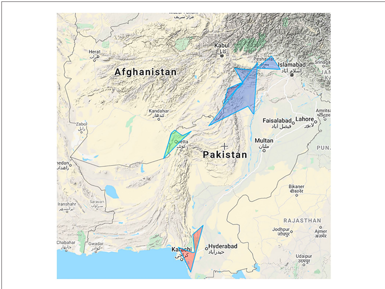
Figure 1. Potential hotspots of terrorist attacks on polio teams (light gray highlight indicates high-risk area, dark gray indicates intermediate risk area, and dark gray indicates low-risk area). Note. Please refer to the online version of the article to view this figure in colour.

vaccine-derived poliovirus type 1 (cVDPV1), or cVDPV3. The presence of virus anywhere poses serious threats to the health of children and can place significant burdens on the health infrastructure and economy of the country. Several social factors have made the eradication of polio virus a major challenge.