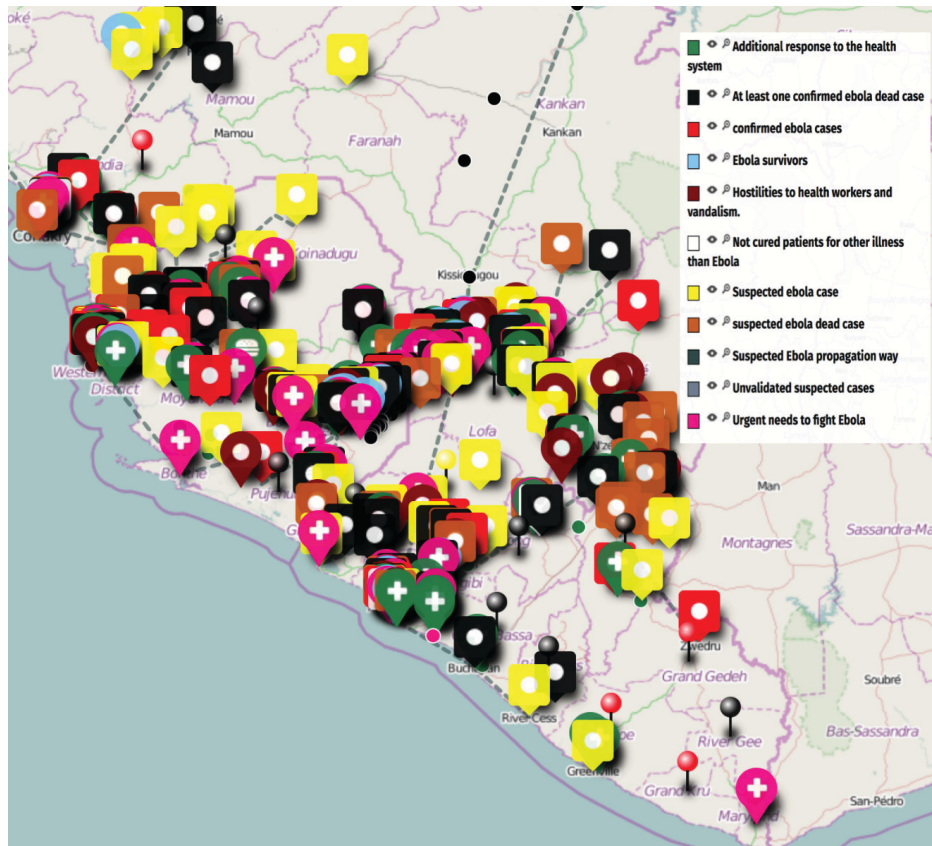
Figure 1. Ebola tracking in Sierra Leone, Liberia and Guinea by Cédric Moro ( http://umap.openstreetmap.fr/en/user/MORO_CEDRIC/ ).