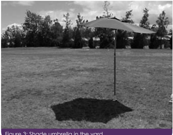
Figure 3: Shade umbrella in the yard.

The SZA for any latitude and longitude can be obtained from the following website: http://www.usno.navy.mil/USNO/astronomicalapplications/data-services/alt-az-world