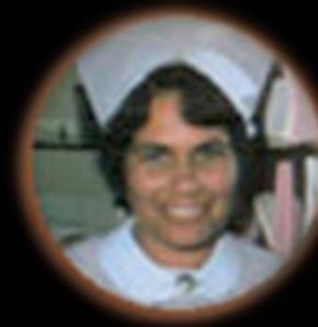
Lowitja O'Donoghue 1950s