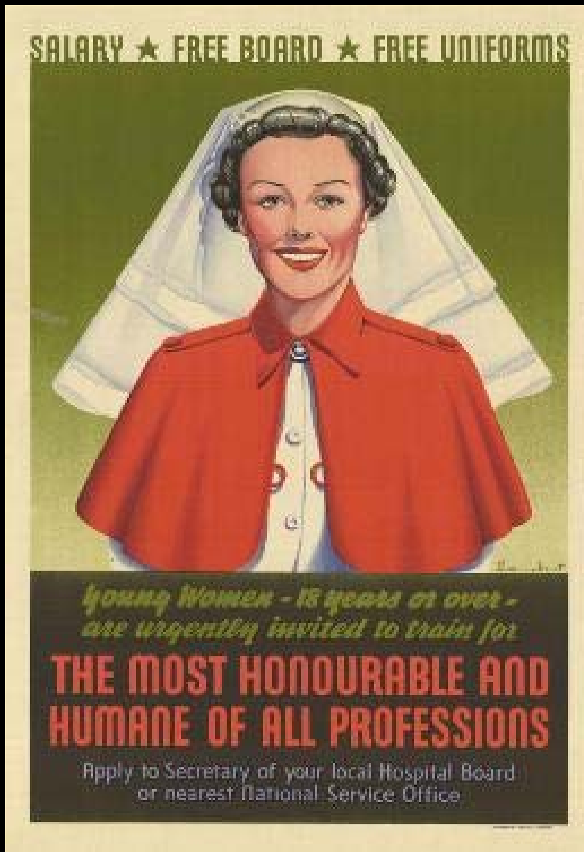
Nursing in 1940's advertisement