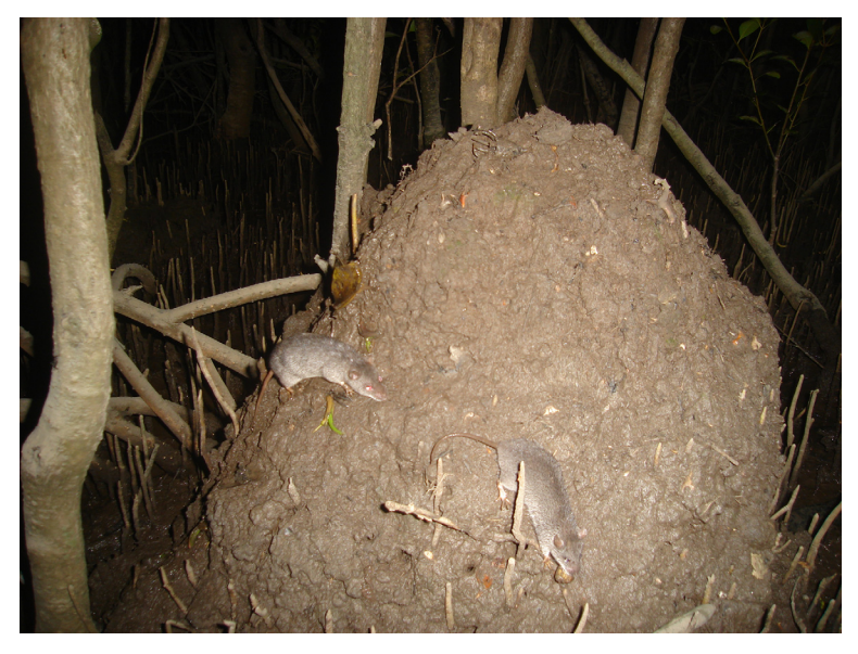
Fig 1. Two water mice maintaining a mound-style nest in a mangrove vegetation community of Sector 3 of the Maroochy River system, 8<sup>th</sup> March 2012.